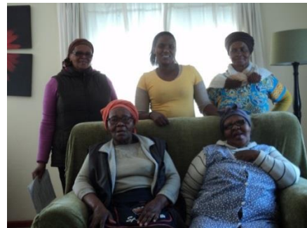
Ladies from Gugulethu